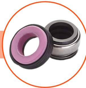
High Tech Mechanical Seal