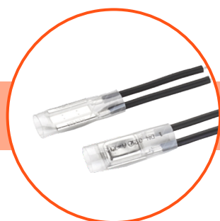
Thermal Overload Protector