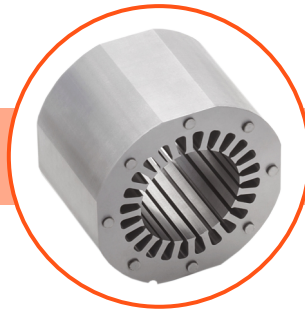
CRNGO Progressive Cutting Stamping Stack